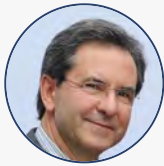
Esteban Moctezuma Ambassador Mexican Embassy

JW Marriott (Salon F), 1331 Pennsylvania Avenue NW, Washington, DC 20004