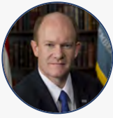
Chris Coons Senator US Senate

Rayburn HOB (Room 2044-2045), 45 Independence Ave SW, Washington, DC 2051