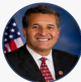
Juan Vargas Representative U.S. House of Representatives

JW Marriott (Salon D&E), 1331 Pennsylvania Avenue NW, Washington, DC 20004