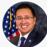
Kent Lee Councilmember, District 6 City of San Diego