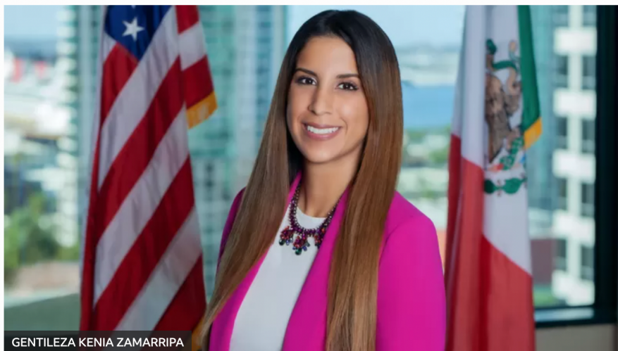
GENTILEZA KENIA ZAMARRIPA

Cali Baja, la dinámica megarregión en la frontera entre Estados Unidos y México que genera millones de dólares y empleos