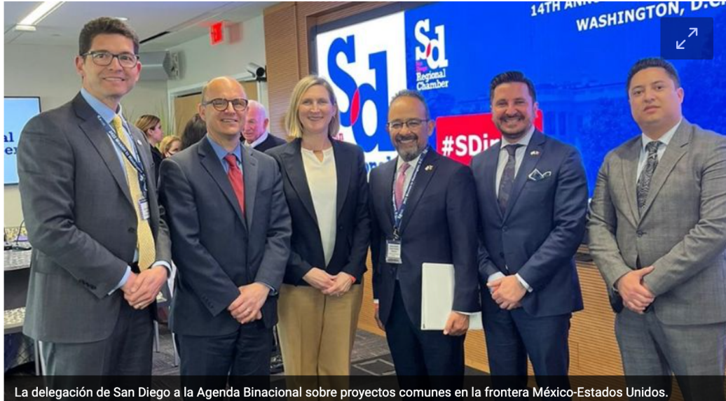
La delegación de San Diego a la Agenda Binacional sobre proyectos comunes en la frontera México-Estados Unidos.