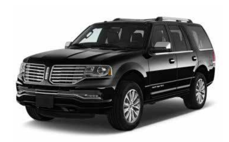
*MINIMUM CHARGE FOR A MAXIMUM OF 10-HOUR SERVICE WITHIN THE FEDERAL DISTRICT. MINIMUM CHARGES OUTSIDE THE FEDERAL DISTRICT VARY DEPENDING ON DESTINATION. / EACH EXTRA HOUR COSTS USD$300 ADDITIONAL CHARGE: 11% TAX